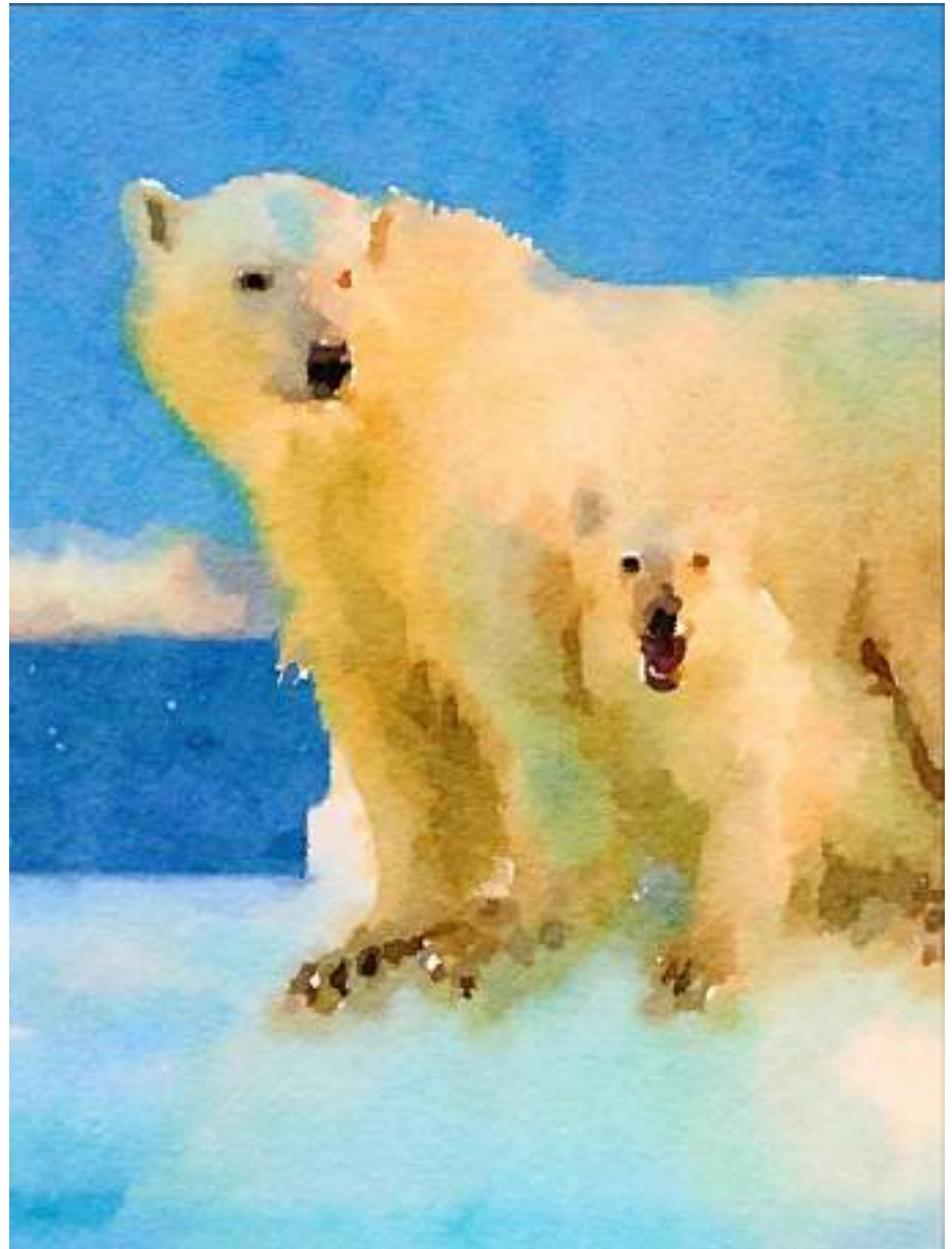
Mother and baby polar bear on a floating sea ice looking for food

LORD, grant us wisdom and compassion to support and to respect the dignity of all creatures in God's Kingdom, like the endangered polar bears living all around the Arctic.