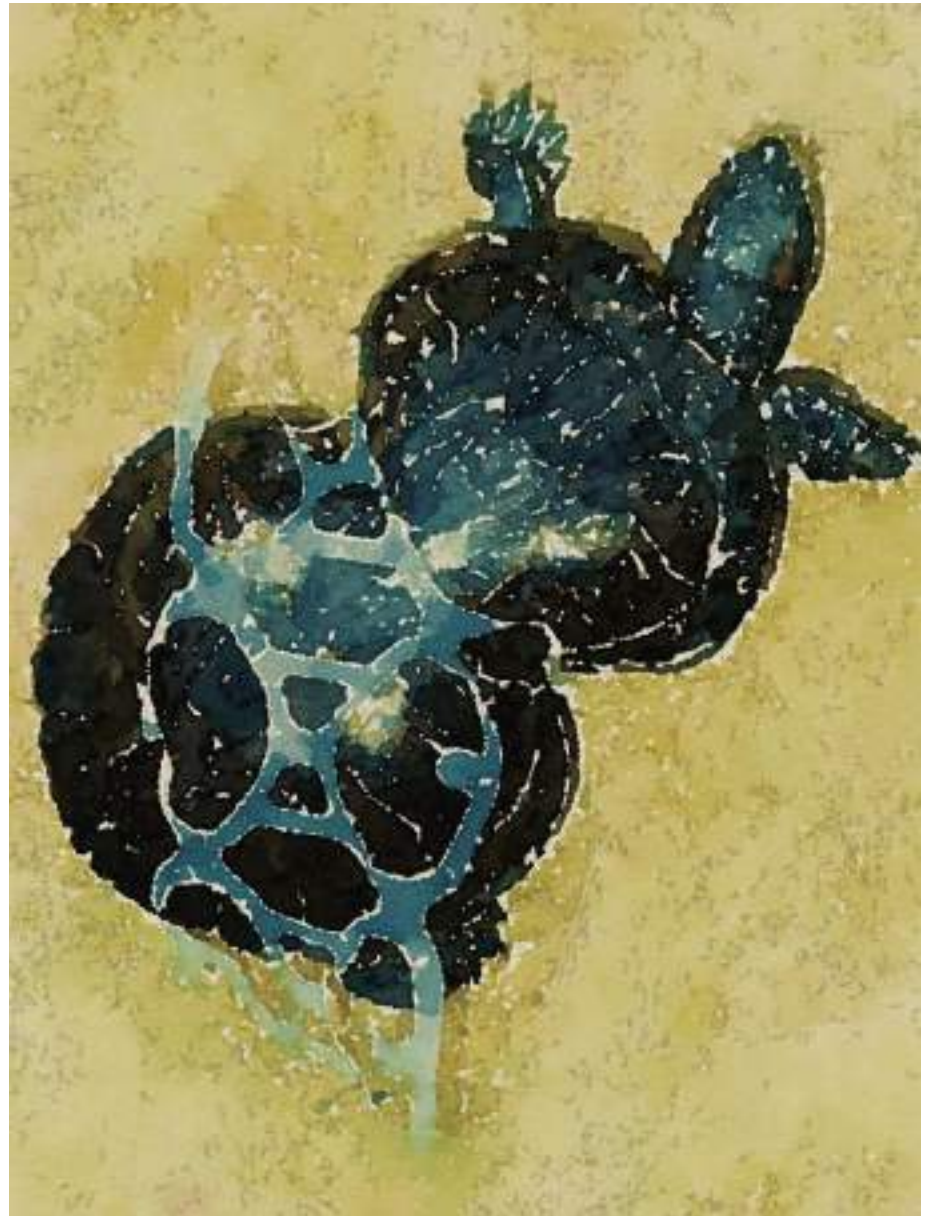
A painful consequence of irresponsible disposal of plastic

LORD , help us to stop denying the known and unknown harm done by our use of plastics that we may change our habits by avoiding or reducing our use of disposable and single-use plastic items, reusing items and/or recycling them.