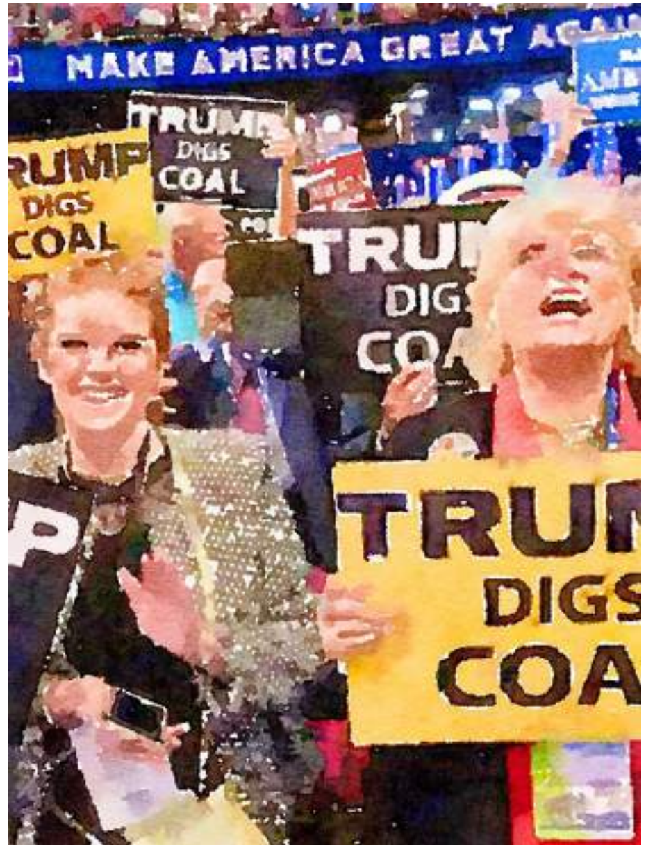
The crowd supporting former President Trump

LORD, inspire our elected officials to help protect the voting rights of all eligible citizens, and guide us to elect leaders who believe that how we treat the Christ in the environment is connected to how we treat the Christ in each other.