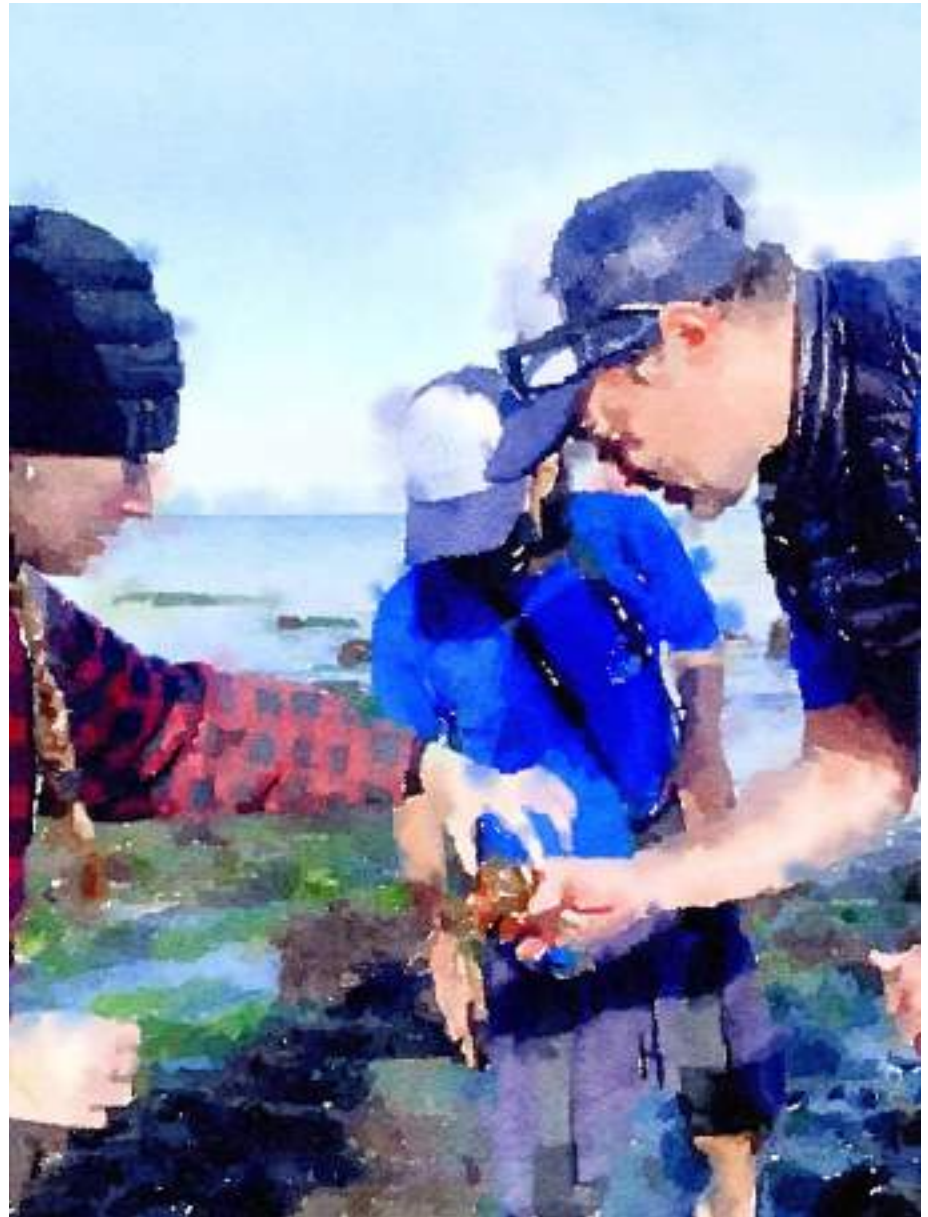
An environmental educator and his students discussing marine life

LORD, open our hearts to honor and support, protect and equip our sustainability professionals and volunteers, environmental educators and all earth stewards as they attend to the health and wellbeing of Mother Earth.