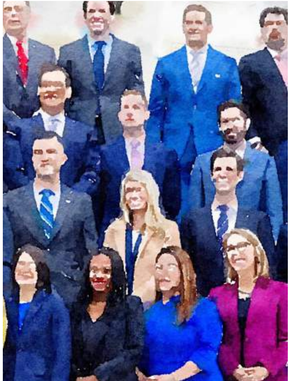
Newly elected lawmakers inducted in the 2023 US Congress

LORD, grant us and our elected officials clarity and understanding of climate science facts that we may stop condemning the Christ in Creation.