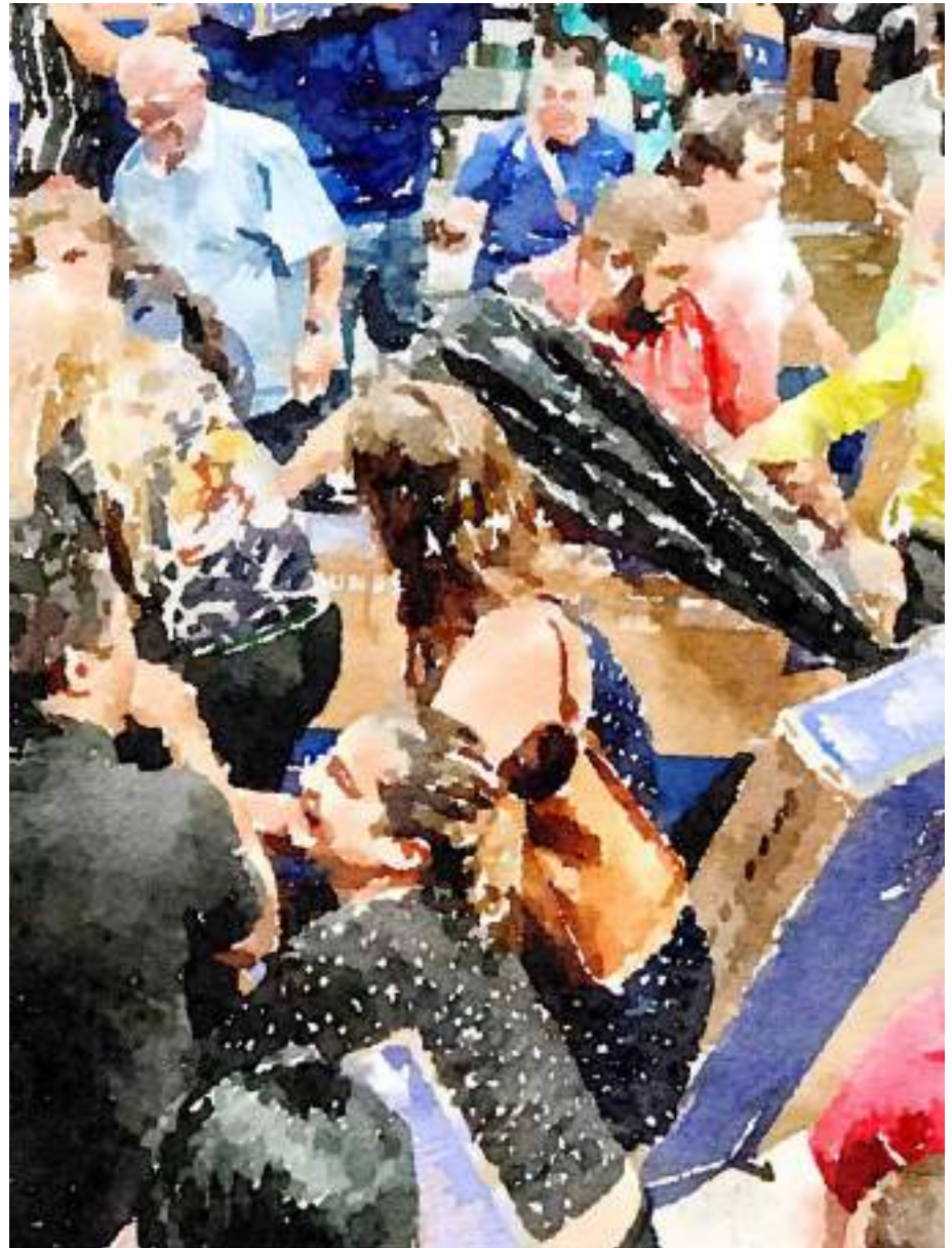
A Black Friday feeding frenzy

LORD, help us to develop new and healthy habits to avoid extremes and excesses, to practice prudence, moderation and gratefulness in the way we consume anything in our daily life.