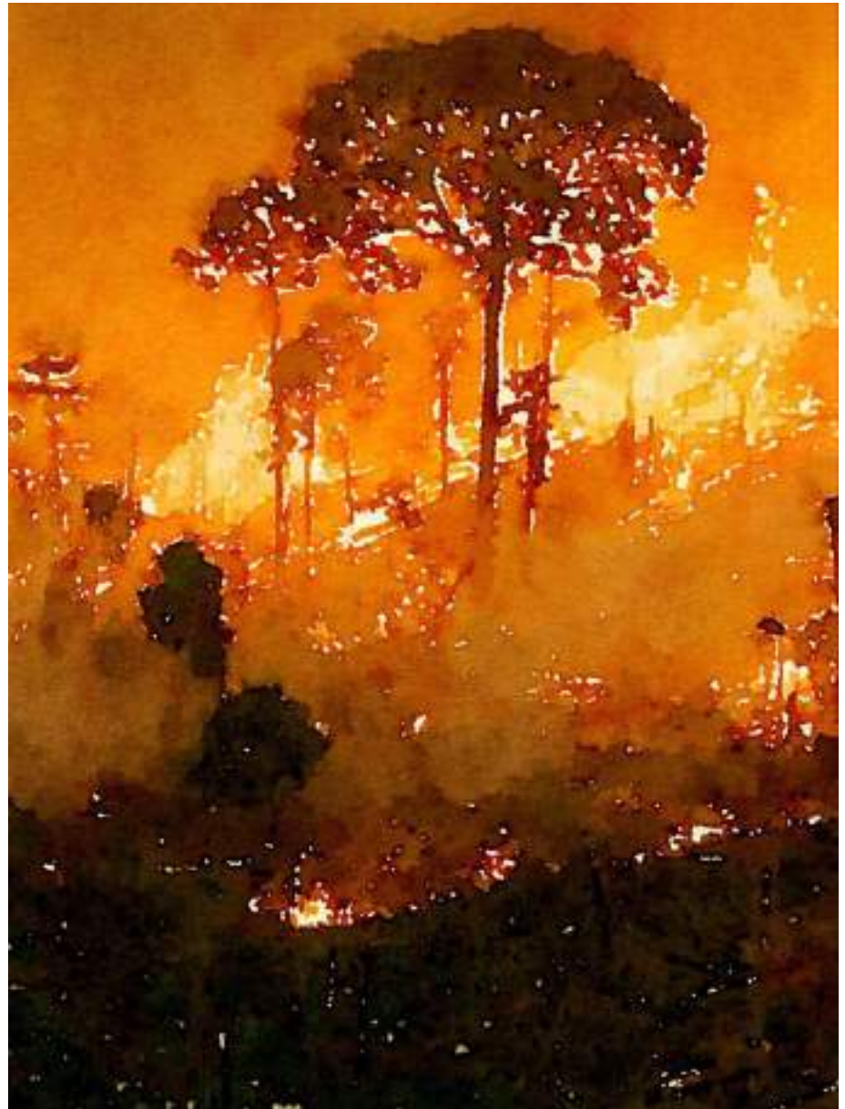
Deforestation of the Amazon Rainforest

LORD, grant us your wisdom and grace, for us to actively support our brothers and sisters who are working to protect the Christ in Creation from the destructive evil of greed and power.