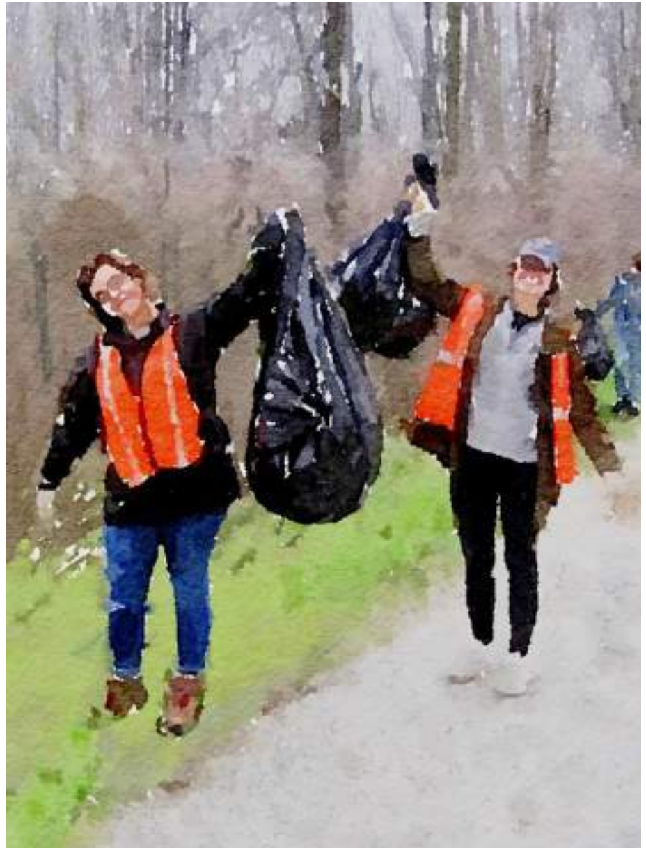
Park cleanup volunteers carrying trash bags collected at a nature trail

LORD, strengthen us to find joy and fulfillment in mindful stewardship, constructive and cheerful service, and loving care for Mother Earth, our common home.