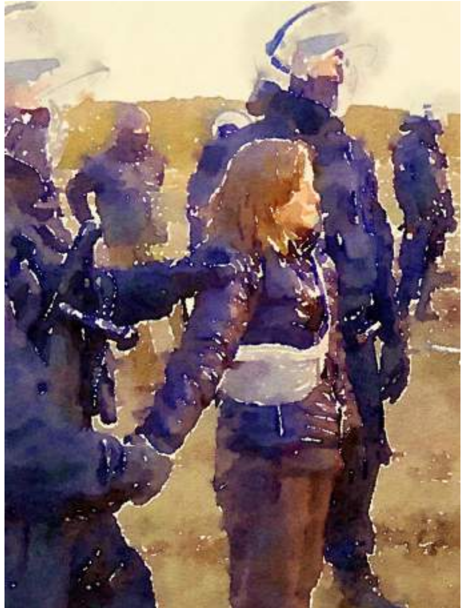
Swedish activist Greta Thunberg arrested during a protest

LORD, grant us the courage and endurance to spread your Gospel of Love for all Creation with non-violent speech and action as inspired by Your Spirit.