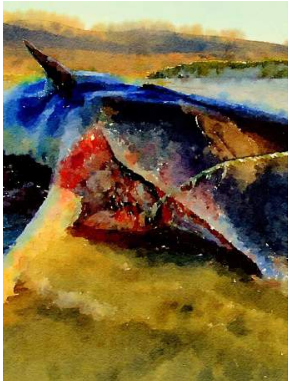
A dead beached grey whale with plastic debris in its stomach.

LORD, assist us in preventing injuries and deaths to the Christ in our brothers and sisters on land, sea, and air due to our selfish wasteful ways.