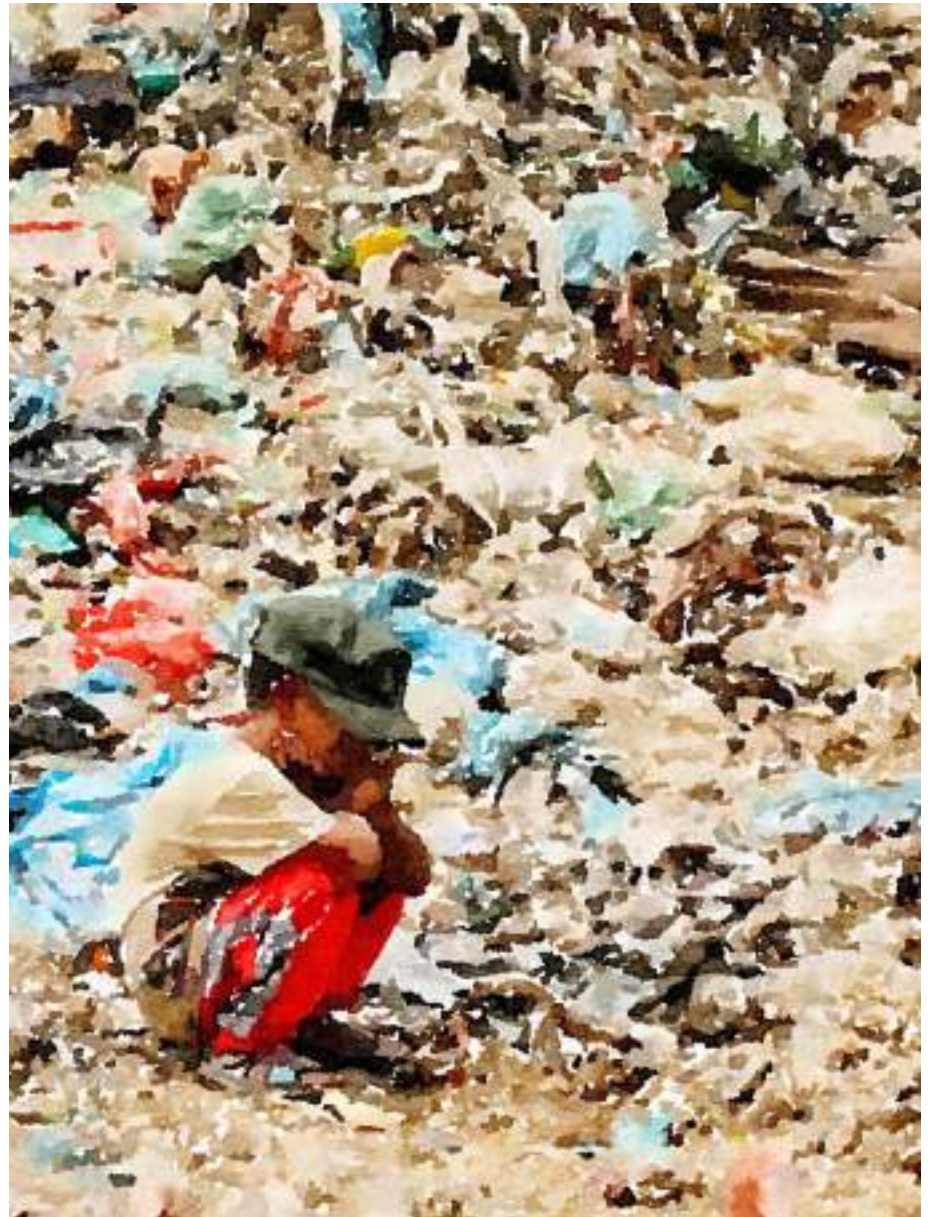
An open landfill called Smokey Mountain in Manila, Philippines

LORD, help us to comfort and assist those who grieve the death of a loved one due to poverty and hunger as a result of environmental injustice and the climate crisis.