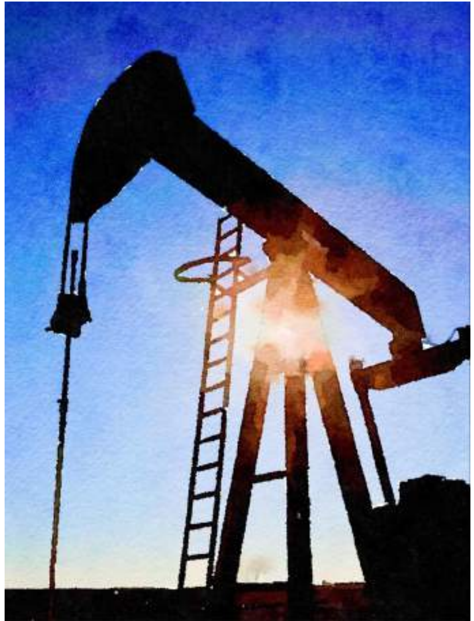
An oil well extracting oil or natural gas to the surface.

LORD, remind us always that using our natural resources in an excessive, careless and mindless way that result in toxic emissions driving climate change, we participate in crucifying the Christ of Creation.