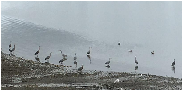
Great Blue Herons and gulls on Budd Bay.