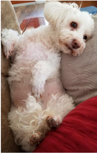
"Saint" Sugar: Her complete trust and simple happiness in just being with me are deeply touching. She has taught me to stop, breathe and simply be...