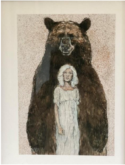
Bears from Pamela Sempel

Bears are powerful creatures and symbols in mythology, story, and on earth. Bears stir our imagination and awaken the power of our subconscious mind. As bears slow down and hibernate, they remind us to move slowly and drop inside ourselves to make choices from our places of intuitive knowledge.