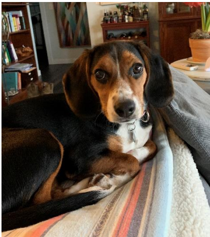
From Dawn Meyer

Bears are powerful creatures and symbols in mythology, story, and on earth. Bears stir our imagination and awaken the power of our subconscious mind. As bears slow down and hibernate, they remind us to move slowly and drop inside ourselves to make choices from our places of intuitive knowledge.